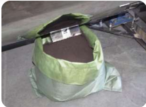
Dry and discharge