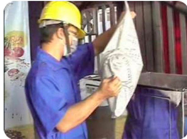
Feed and add enzyme